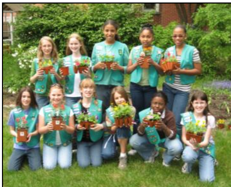
Girls Scouts from Troop 306 pose with the flowers that were planted in the gardens of the Stroud Mansion.

Of course, I still remain the expert on items from the past. In my Musings article in each The Fanlight issue I will include an artifact from the MCHA collection. See if you know what it is from my clue. The correct identification and some history of the use of the item will appear in the following issue of The Fanlight .