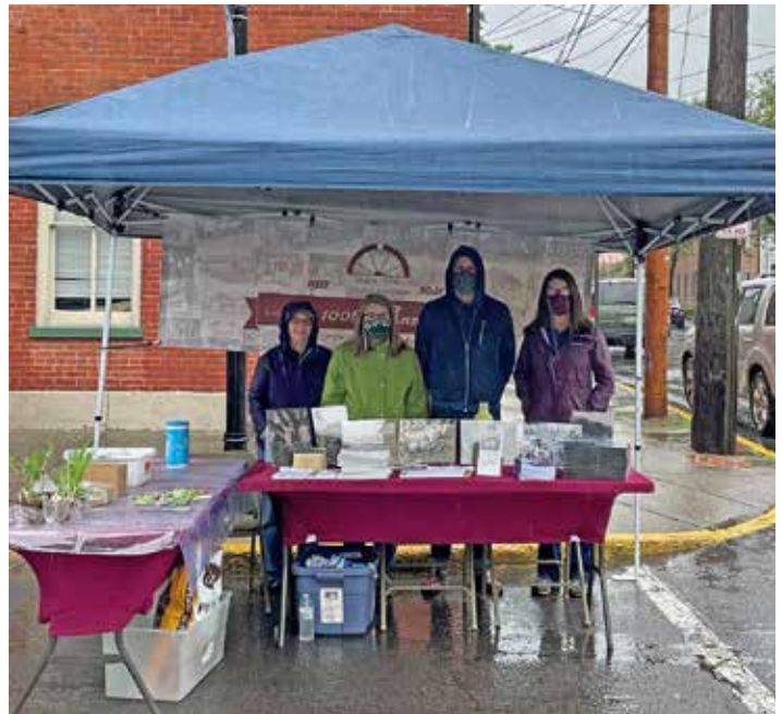
MCHA staff and volunteers bundled up for the near-freezing cold and rainy Monroe Farmer’s Market on Saturday, May 29.