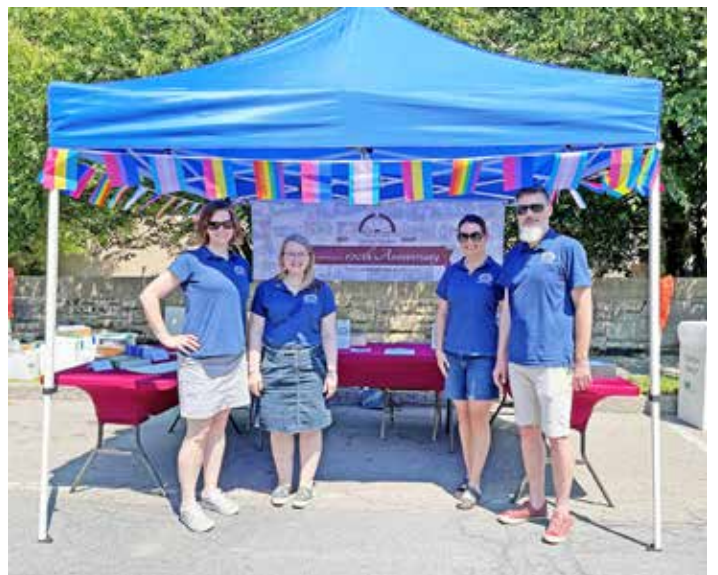
Historical Association staffers were happy for the shade and had plenty of water on hand for the 90+ degree weather during the Pocono Pride Fest on June 6 in Stroudsburg.