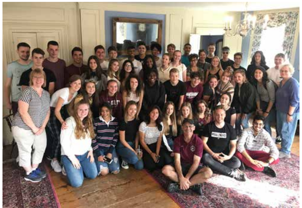
American and German high school students gather for a photo at Stroud Mansion.

Annual wine-pairing dinner and auction. Our major fundraising event of the year.