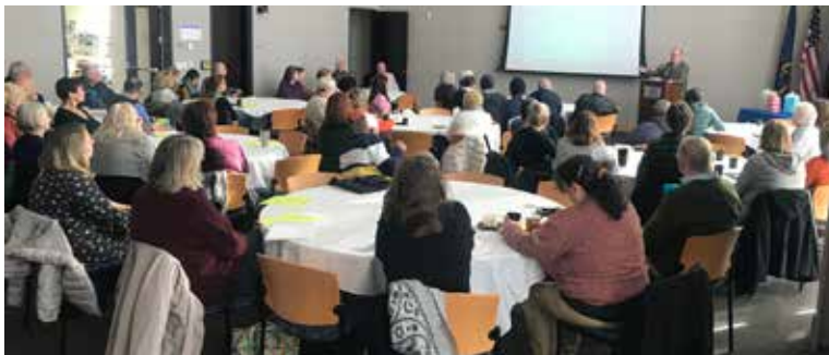
The History Fair at Northampton Community College's Monroe Campus in Tannersville was well attended.

Over 80 guests explored Pennsylvania's history November 14 at the History Fair at Northampton Community College's Monroe Campus. From colonization to chocolate, the free event focused on famous Pennsylvanians, with an emphasis on innovation.