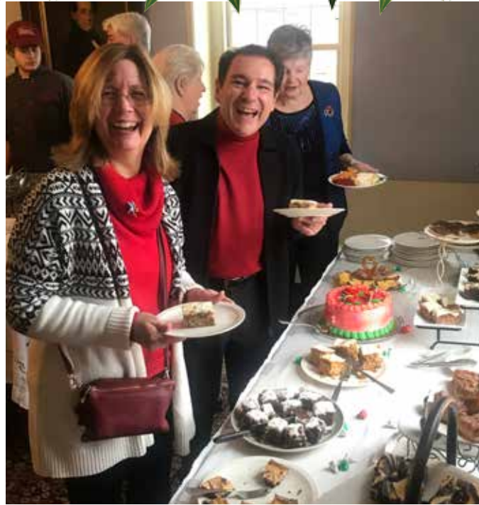
Enjoying the array of desserts at the Holiday Luncheon.