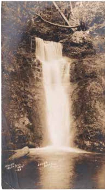
Buck Hill Falls was the 2019 Premier Sponsor of the "Raise Your Glass & Support the Past" fundraiser.