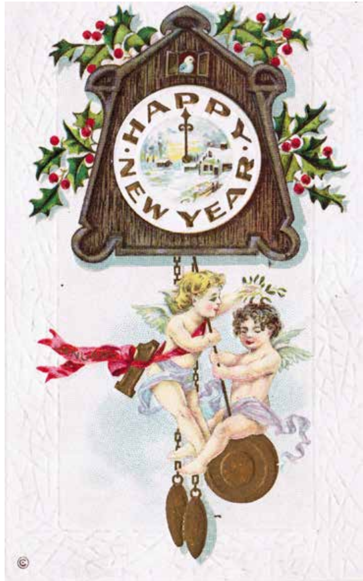
A vintage New Year's postcard from the MCHA Collection

Tonight's December thirty-first, Something is about to burst. The clock is crouching, dark and small, Like a time bomb in the hall. Hark, it's midnight, children dear. Duck! Here comes another year!"