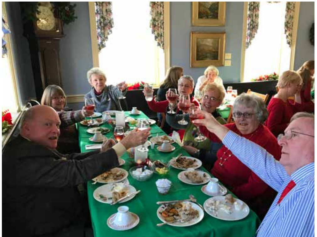
Members of the Stroudsburg High School Class of 1963 raise their glasses in festive cheer during the Holiday Luncheon at the Stroud Mansion.