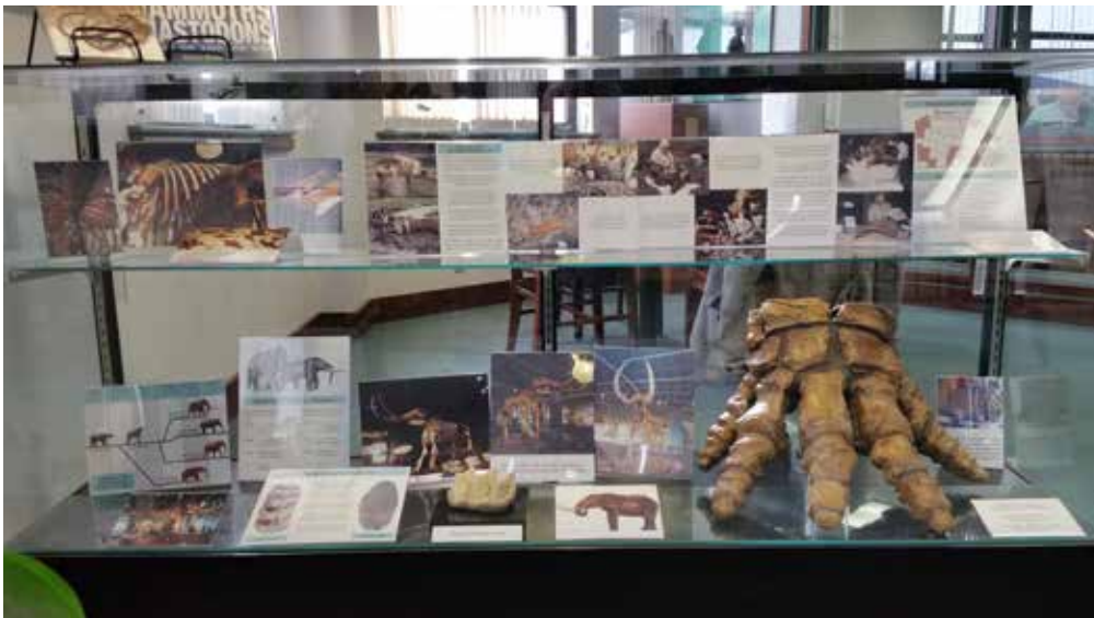
An MCHA exhibit on the Marshalls Creek mastodon is at the Hughes through May 31.