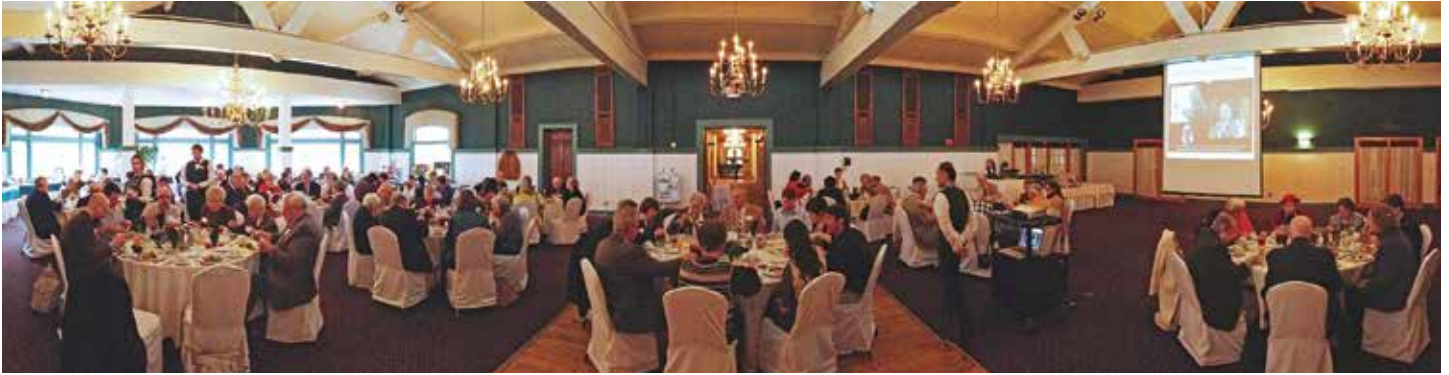
Panoramic view of the 110 guests at the Annual Meeting and Awards Luncheon, held February 24 at Shawnee Inn and Golf Resort.