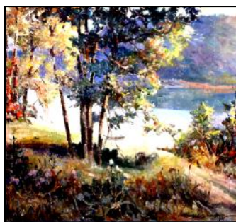
Morning Light Schoonover

Frank E. Schoonover (1877-1972) was born in Oxford, New Jersey. In 1896, he was accepted