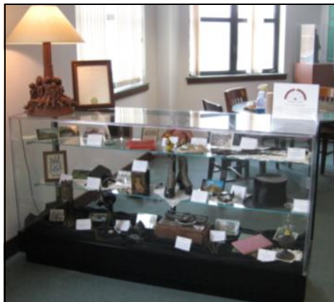
Display case at Eastern Monroe Public Library

a wide appeal to the general public. From a man's beaver-skin top hat and ladies elbow-length kid gloves to an early typewriter and postcards, the small display case is packed with items.