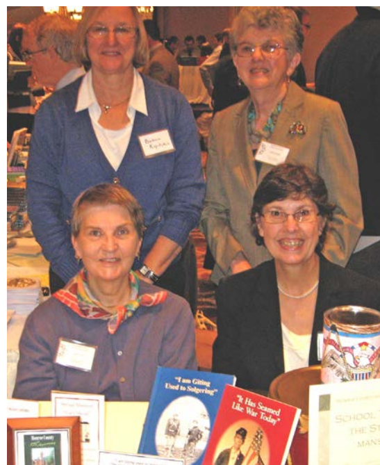
Four members of the Education Committee attended the conference.

We gained many ideas and new contacts, and thank the MCHA board for letting us share the importance of local history with other educators.