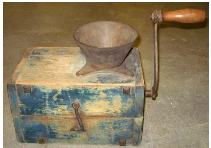
Fleischmuel – Sausage grinder

Be sure to look for me when you visit! You never know in what corner I may be spending my afternoon.