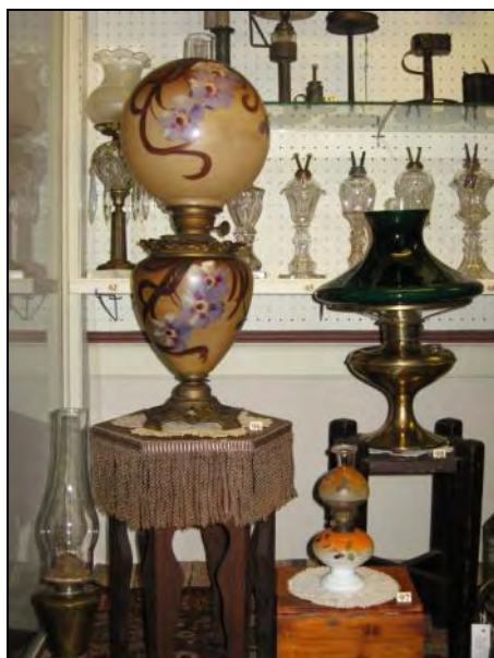
Several of the over 130 lamps in the exhibit at the Stroud Mansion.