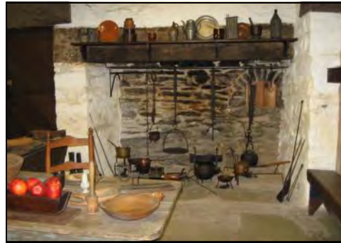
The Colonial kitchen display in the Stroud Mansion

Plan to visit the Stroud Mansion to see this amazing collection. One of our visitors already confessed that our Colonial Kitchen exhibit was "better than Williamsburg!" Well, that is certainly a complement!