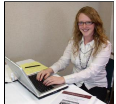
Halle at workshop in Exton

Washington County Rural Heritage Museum in Maryland, to historical organizations like the Trenton Historical Society in New Jersey and large institutions such as the Please Touch Museum in Philadelphia. There was even an international attendee from the Toronto Historical Society in Canada.