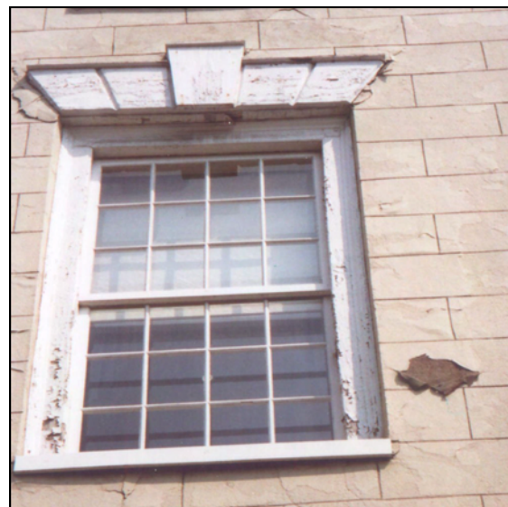
Peeling paint on the Stroud Mansion

Donations are desperately needed to fund the completion of the restoration. The cost to restore the last two exterior walls of the Stroud Mansion is $19,000. This figure includes the work to repair the stonework and stucco, to paint the exterior of the old Mansion, and to power wash and repaint the wooden portions of the 1893 addition located at the rear of the building.