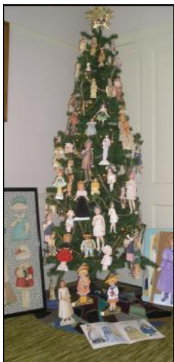
Tree decorated with paper dolls by the Pocono Doll Club

Words that describe the Stroud Mansion during the holiday season include warm, festive, and, of course, very merry. The staff and volunteers love this time of year, and it shows.