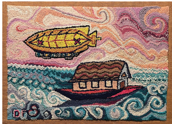
"Noah's Ark," a hooked rug by Dorothy Strauser

Noon-5 p.m., Crystal Street, East Stroudsburg