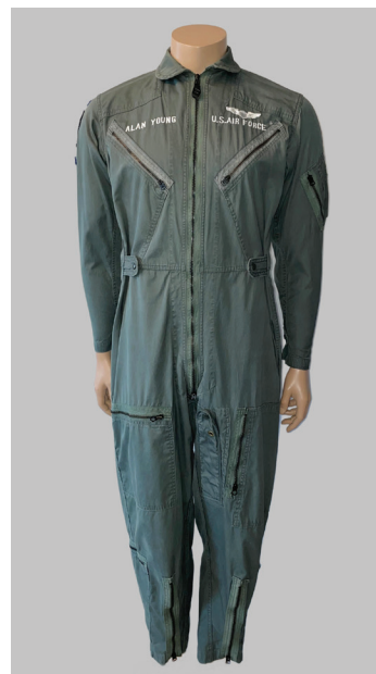
Left: Young's flight suit, now in the MCHA collection, labeled "Coveralls, Flying, Man's, Very Light, K-28, 8-Jan-1968."

The suit features his machine embroidered name and captain's bars, and applied shoulder patches on the right sleeve.