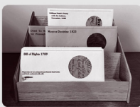
HISTORIC DOCUMENT REPLICAS