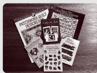
ARTS & CRAFTS BOOKS