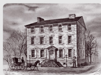
ARTWORK & PRINTS