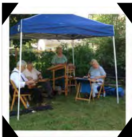
Visitors enjoy the musical stylings of the Pocono Dulcimer Club.