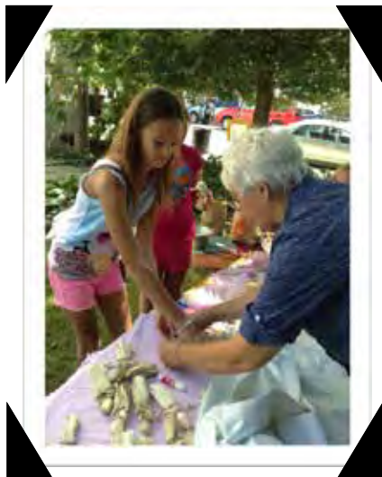
Guests learn how to make corn husk dolls.