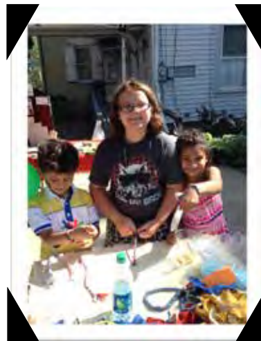
Showing off their newly made fabric bracelets.