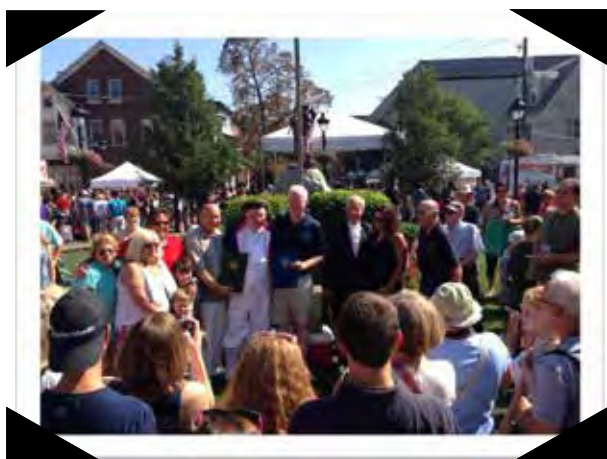
Left: Elected officials and members of the Bicentennial Committee bury a time capsule during Stroudfest.