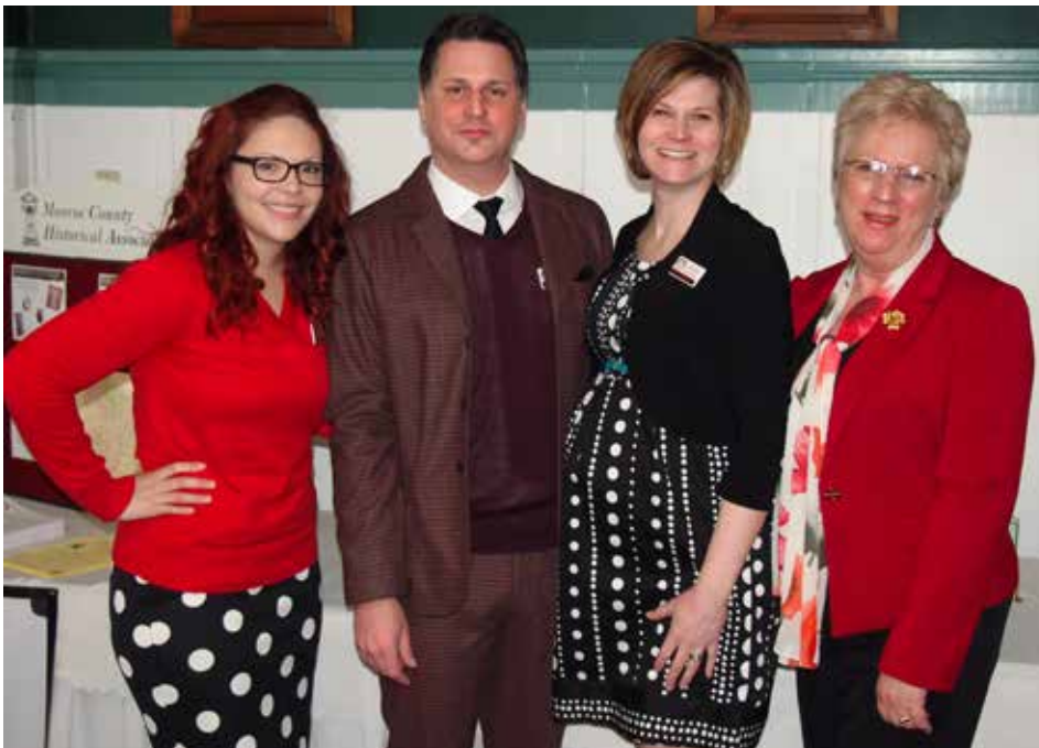
The Monroe County Historical Association staff at the Annual Meeting in February.